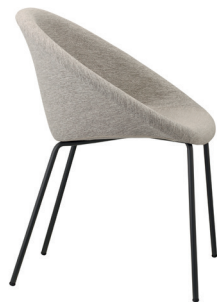
2685 VA T6 28

Poltrona con scocca imbottita e anima in tecnopolimero. Struttura a 4 gambe in acciaio tubolare \varnothing mm 16 verniciato antracite. Giulia Pop è adatta a tutti gli ambienti dalla casa al contract. Rivestimento in tessuto non sfoderabile. Per uso interno.